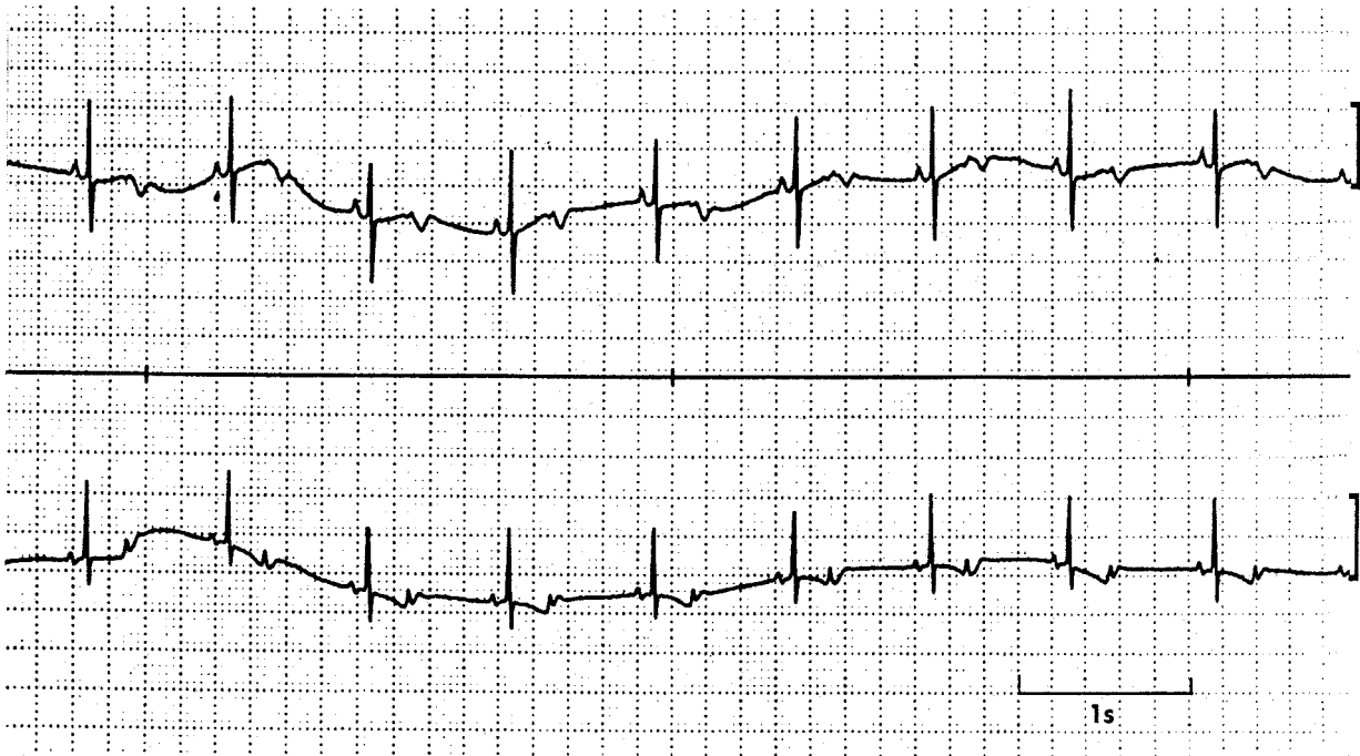
Figure 5 ECG tracings of a newborn with blocked atrial bigeminy which simulates sinus bradycardia. Blocked P waves are present when examining the T waves.

ECGs and diagnostic procedures do not confirm the presence of LQTS, it is logical to progressively withdraw therapy and to return to periodic observations.